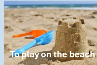
To play on the beach