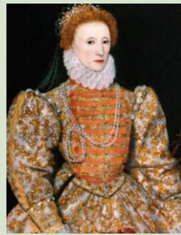
Queen Elizabeth I