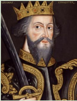
William the Conqueror